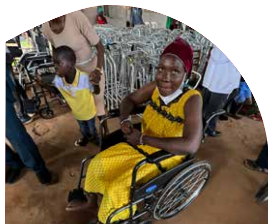
Patient at Victoria Care Home in Columbo sit proudly next to his assisted mobility device. Wheels to Heal volunteers in Glasgow loading a container desitined for The Gambia. Victims of the Pakistan Floods standing behind their ruined home recieve Zakat Funds. A disabled female recipient from Jinja, Uganda in her gifted wheelchair.

The lengthy process for renewed funding left a period of uncertainty although good relations remained in place between both parties. The cost of living crisis continued to impact our shipping, van hire and fuel costs. In part we were able to address this through strengthening partnerships and working with other charities such as MyMalawi and larger international disaster focussed charities ISRA UK and Action for Humanity.